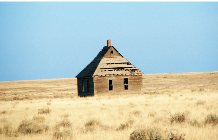
Undiscovered resources in Kiowa County