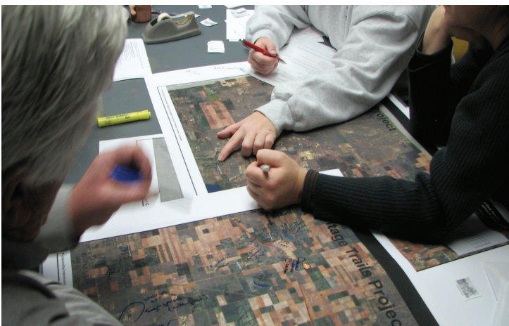
figuring it out together